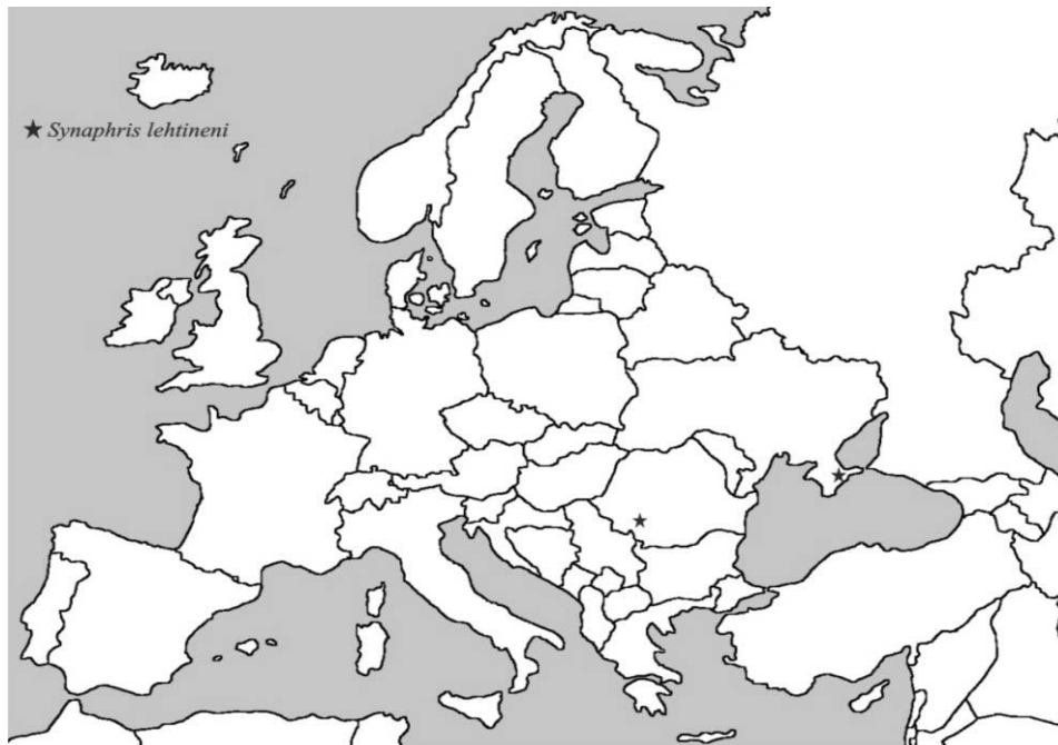
Fig. 1. Map showing the geographic distribution of species Synaphris lehtineni Marusik, Gnelista & Kovbliuk, 2005 in Europe.