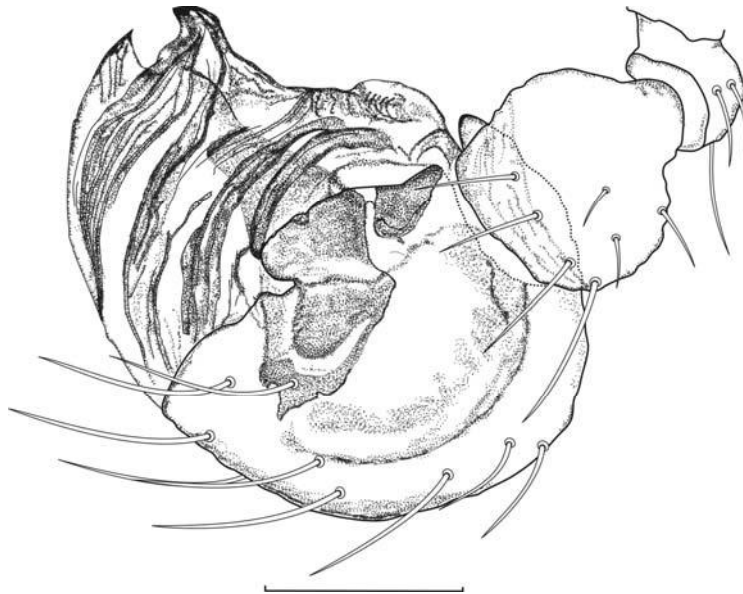
Fig. 3. Male palp, dorsal view. Scale bar 0.1 mm.