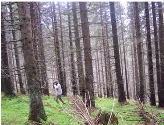
Fig. 4. – Old spruce forest with high productivity (litter with vegetal layer consisting of Oxalis and Luzula . (1386 m) – the most balanced area in faunal composition.

For the Pietrosul Mare Scientific Reservation, the zoogeographic analysis indicates that the Araneae and Collembola are represented by a large number of widespread species (56% palaeartic species of Araneae, 30% cosmopolite species of Collembola) and the Orthoptera and Coleoptera are represented by species with more confined ranges (Fig. 4), the European elements being well represented for the all investigated taxonomic groups. The percent of endemic species (Carpathian endemites) has a significant variation between the studied taxonomic groups: 0% for Araneae and 1% for Collembola, to 25% for Coleoptera (from a total of 103 species) and 29% for Orthoptera (from a total of 14 species). As for the Coleoptera, the Carpathian endemites are prevalent in the alpine-subalpine zones (above the “ant-belt”) (Annex I).