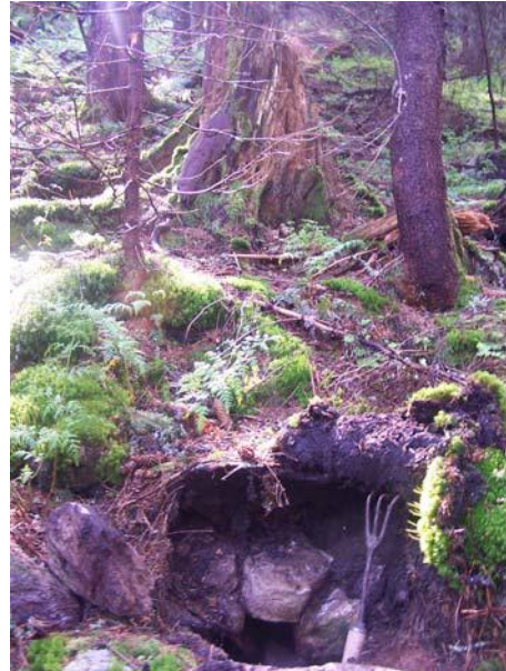
Fig. 3. – Litter detail in the old spruce forest with low productivity (1413 m elevation) – the richest habitat in Collembolan species.